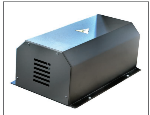
CARTER FOR ROTATION'S MOTOR