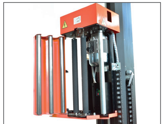
IN OPTION: POWER PRE-STRETCH CARRIAGE